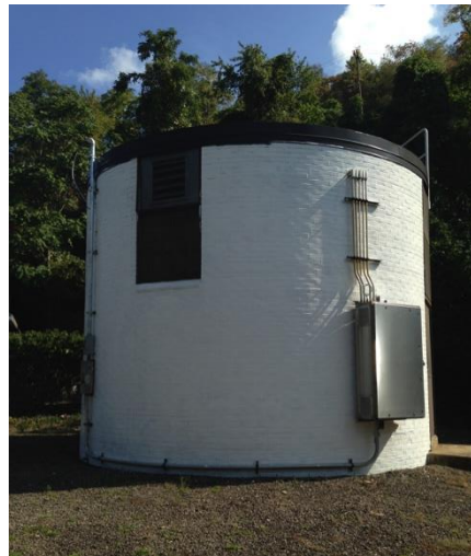
Primed for New 2015 Mural

The Greenfield Community Association's Public Spaces Stewardship Committee, in cooperation with Hazelwood community, is calling for mural designs for the water pump house at the corner of Greenfield Avenue and Irvine Street. This is where Greenfield and Hazelwood communities meet.